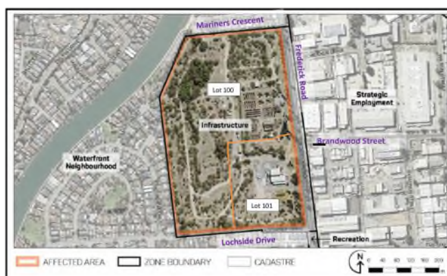
Figure 1: Affected Area and Existing Locality Zones

The Affected Area comprises around 19.8ha of land bound by Frederick Road to its east, and Lochside Drive and adjoins residential properties located within the Waterfront Neighbourhood Zone to its immediate north, south and west. The north-western corner of the Affected Area adjoins the Council owned Mariners Reserve (see Figure 1).