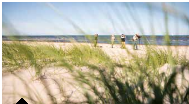
Birdlife Australia with local volunteers monitor and help protect the nesting sites of the Red-capped Ploverin at Tennyson Dunes.