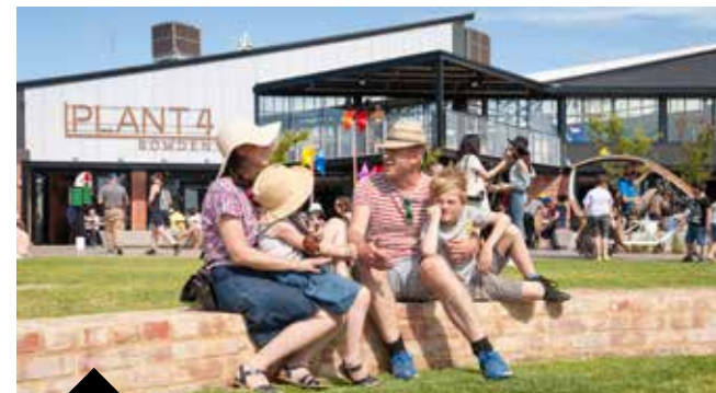
Families and visitors come from near and far to enjoy the thriving community and activities at Bowden.