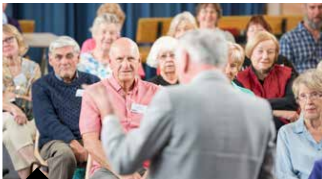
Members of the University of the Third Age at Fulham Gardens listen intently to a guest speaker talk about the history of the Panama Canal.