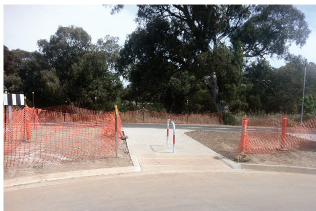
DDA Compliant Pram Ramp

If no landscaping is undertaken we will topsoil the area either side of the path. If you wish to be provided with lawn seed which will grow back over time, please ring 8408 1111 to arrange. Please note the property owner will be required to maintain and water the lawn seed until it is re-established.