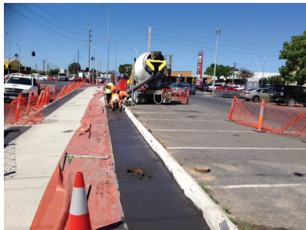
Laying of New Path Surface