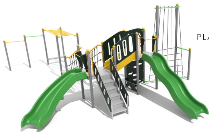
PLAY STRUCTURE (modified)