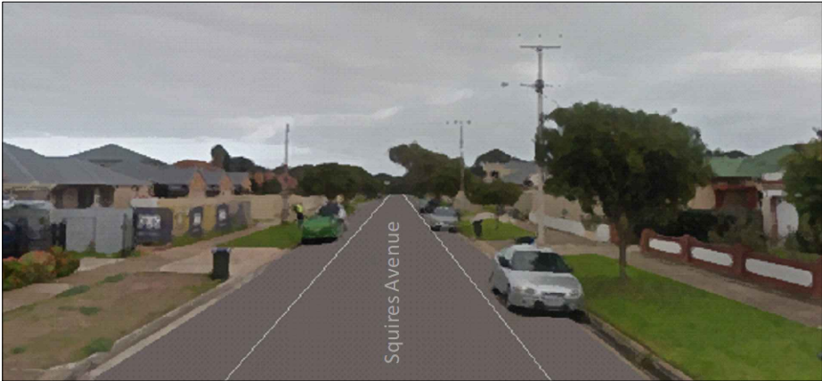
TYPICAL CROSS SECTION