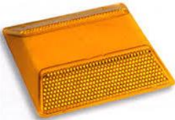
Example of a retro reflective pavement marker