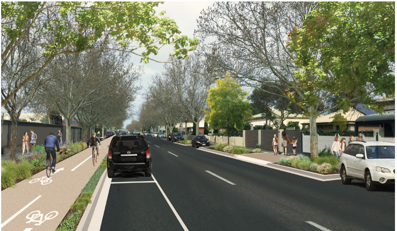
Modified Option 1 (off-road bike path on eastern side) – Typical Cross-section (looking north)