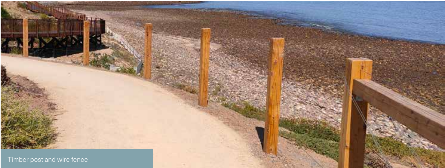
Timber post and wire fence