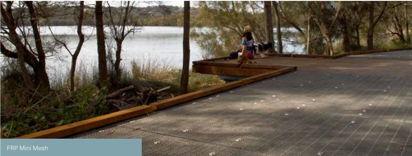
FRP Mini Mesh