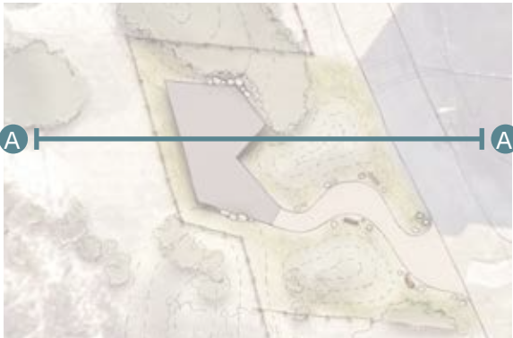
Section A |