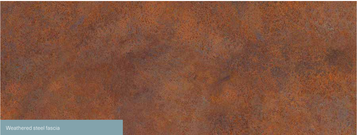
Weathered steel fascia