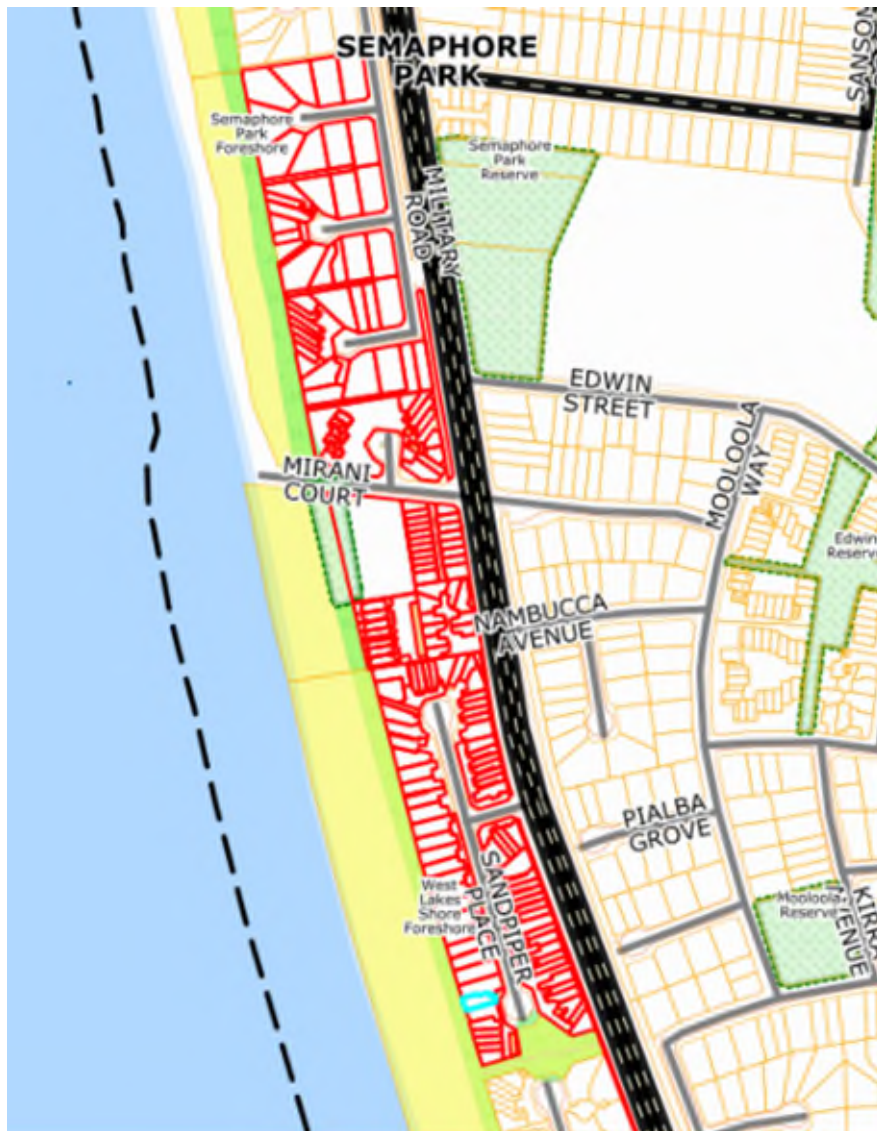
Figure 1 – Map showing mailout locality