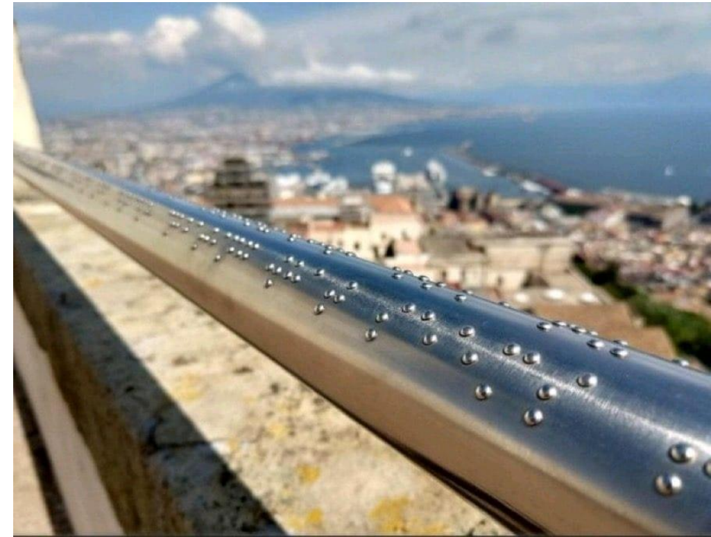
Example of a railing in Naples that has Braille on it to describe the view