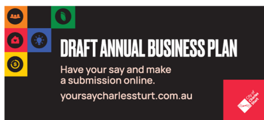
Figure 1: Banner installed at Henley Beach and Port Road