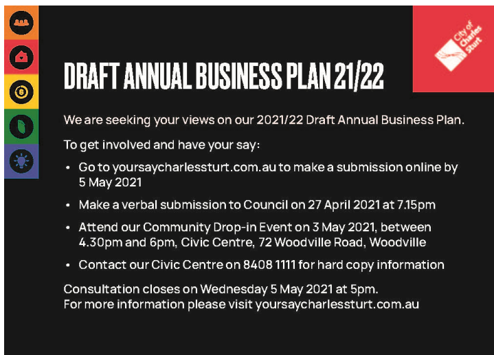
Figure 5: Public Notice, The Advertiser Newspaper on Tuesday, 13 April 2021