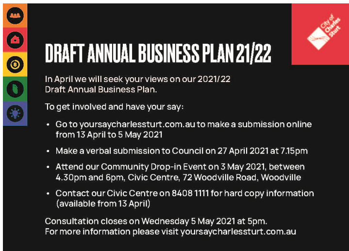
Figure 4: Public Notice, The Advertiser Newspaper on Tuesday, 6 April 2021