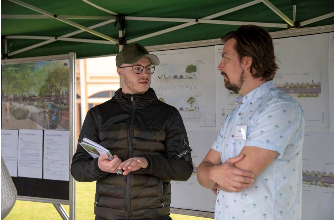
Landscape architects speaking with community members at the pop-up in Henley Square.